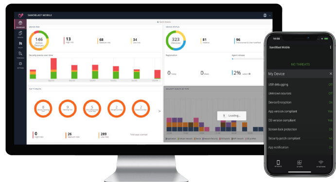
SandBlast Mobile Management Console